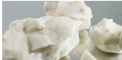
Natural hectorite clay