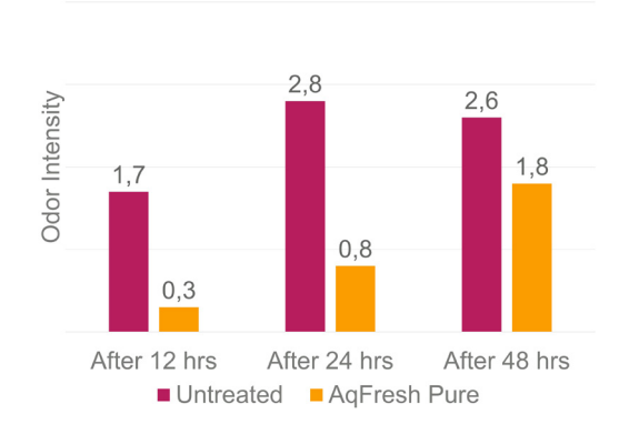
Graph1: Deodorant home test over 48 hours

The deodorant efficacy was confirmed by assessing the clinical efficacy by three expert odor evaluators on 12 panelists. It could be proven that the inclusion of 0.3% AgFresh™ Pure provides immediate (after 2 minutes) and longterm (up to 48 hours) odor reduction at a very high significance level of p<0,005. In this test AgFresh™ Pure reduced the odor perception from perceptible to not or barely perceptible.